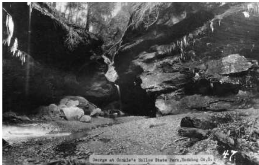
Gorge at Conkle's Hollow