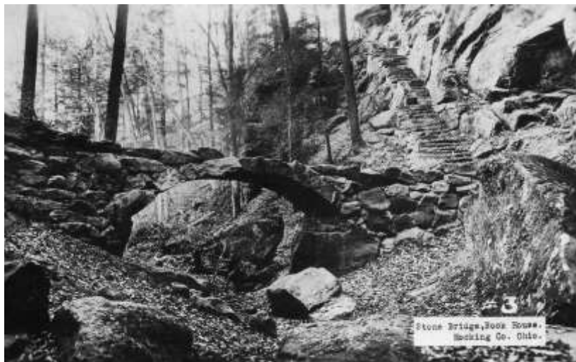
Stone Bridge at Rock House