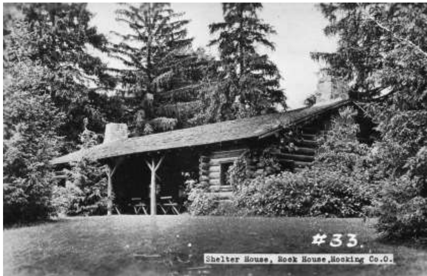
Shelter House at Rock House