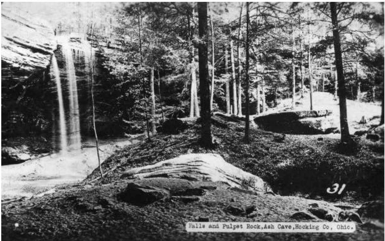
Pulpet Rock at Ash Cave State Park