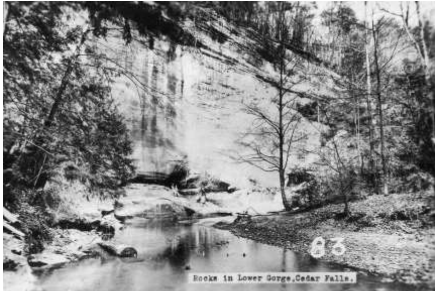
Lower Gorge at Cedar Falls