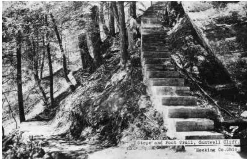
Steps at Cantwell Cliffs