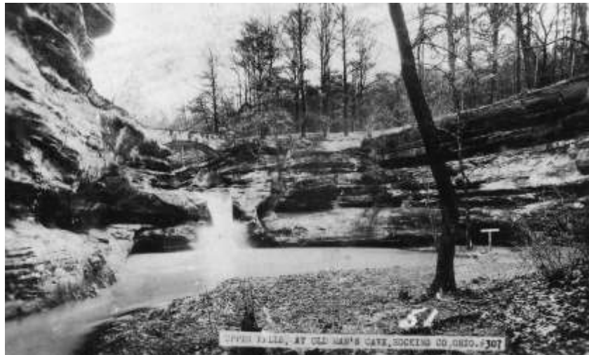
Upper Falls at Old Man's Cave