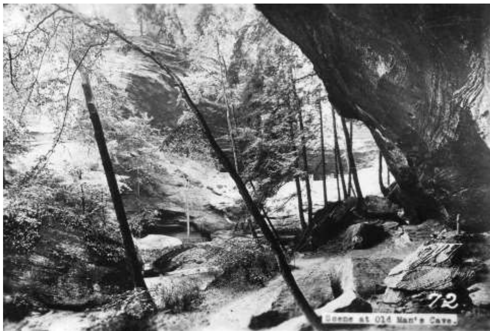
Scene at Old Man's Cave