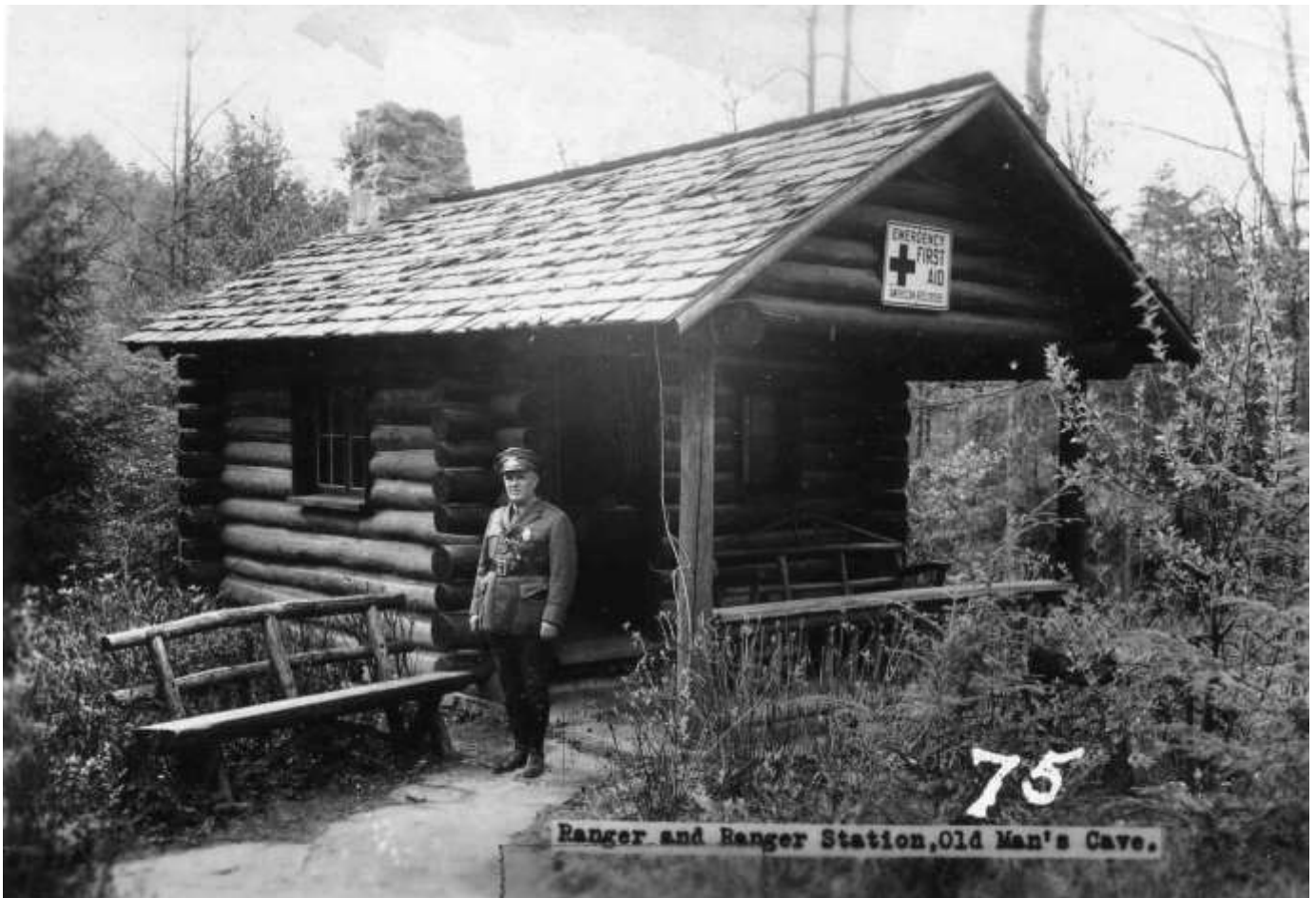
Ranger at the Ranger Station at Old Man's Cave