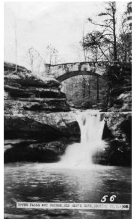
Upper Falls at Old Man's Cave