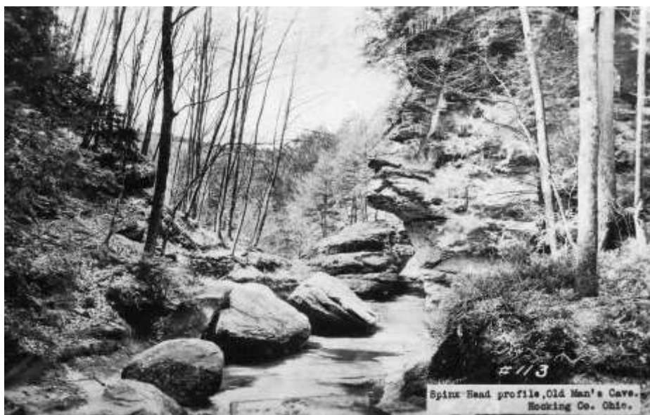
Sphinx Head at Old Man's Cave