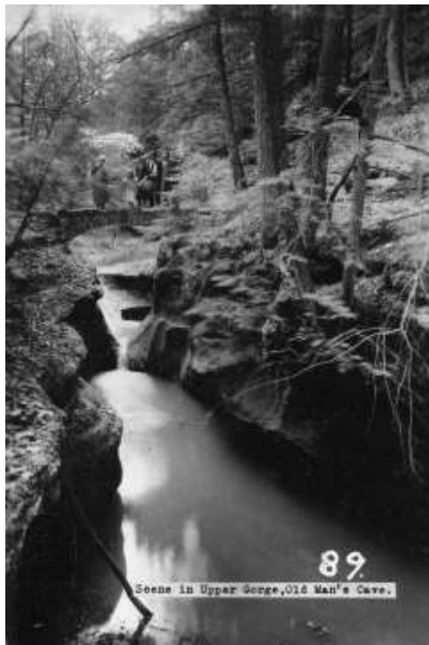
Upper Gorge Old Man's Cave