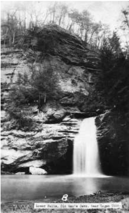
Lower Falls at Old Man's Cave