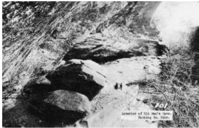
Interior of Old Man's Cave