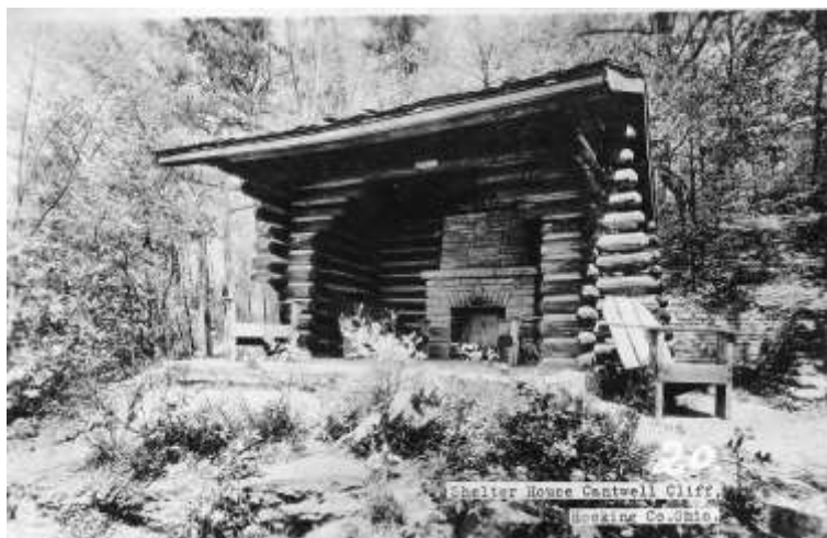
Shelter House at Cantwell Cliffs