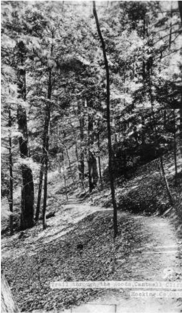
Cantwell Cliff Trail