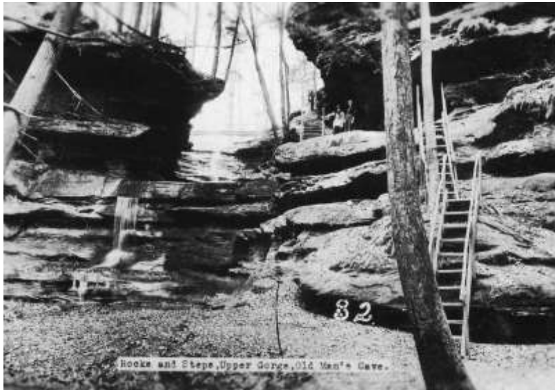
Rocks and Steps at Upper Gorge Old Man's Cave