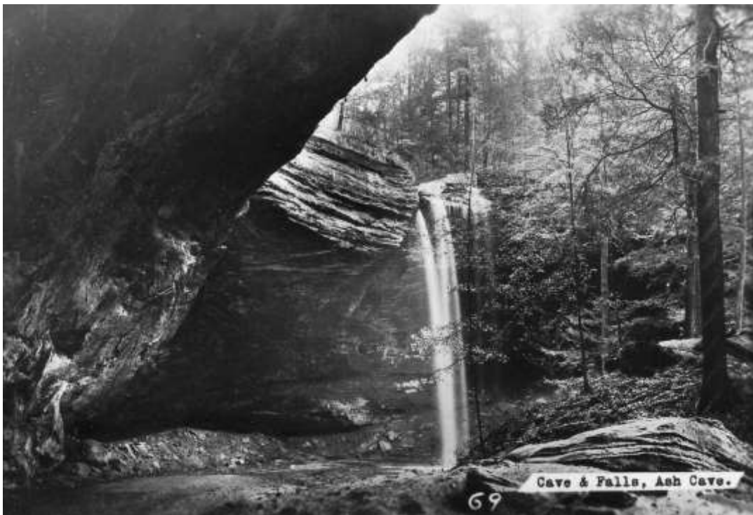
Ash Cave State Park

These pictures were taken about fifteen years later. It is interesting to see how many improvements have been made to the park and to see how much the trees have grown in seventy five years!