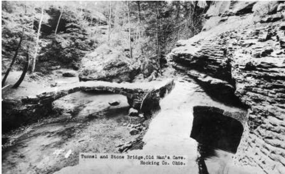
Tunnel and Stone Bridge, Old Man's Cave. Hocking Co. Ohio.